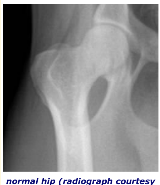
normal hip