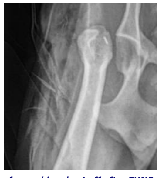
femoral head cut off after FHNO

Ultimately, the goal of the femoral head and neck ostectomy (FHNO) surgery is to create a false hip joint that will be more comfortable and yield better mobility than the diseased joint the patient had before. Since results are generally so good with surgery, provided the patient is relatively small and/or relatively active, often simply removing the femoral head is the least invasive, least costly, and fastest route to a pain-free mobile hip.